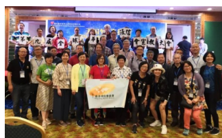
Convention of Hong Kong Baptist Churches leaders and missionaries