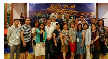
Canadian pastors and missionaries