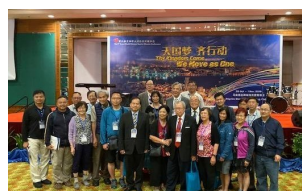
US and Canadian participants