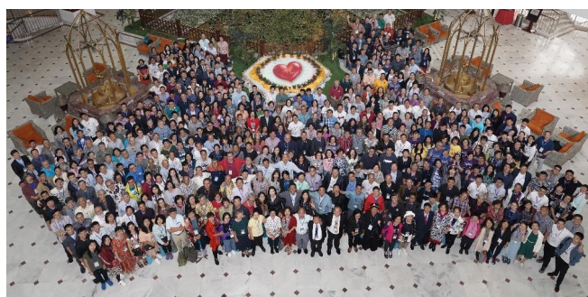
Participants at the TWCBM Conference in Penang, Malaysia

and missions organizations from all parts of the world to further enhance missionary work, believing it is only through unity in the body of Christ that we can fulfill the responsibility of world evangelization.