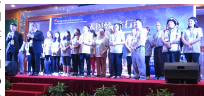
The Myanmar Chinese Baptist Convention was formally constituted and welcomed

During the Conference, we witnessed the constitution of the Myanmar Chinese Baptist Convention and welcomed it as a member of the Transworld Chinese Baptist Mission. The Conference concluded with the adoption of several action plans, among which was for Chinese Baptist Conventions and Chinese Baptist Theological seminaries around the world to work together in establishing a consortium of Chinese Baptist Mission Training Centers to train and equip more missionaries.