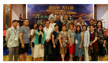
加拿大團隊及宣教士