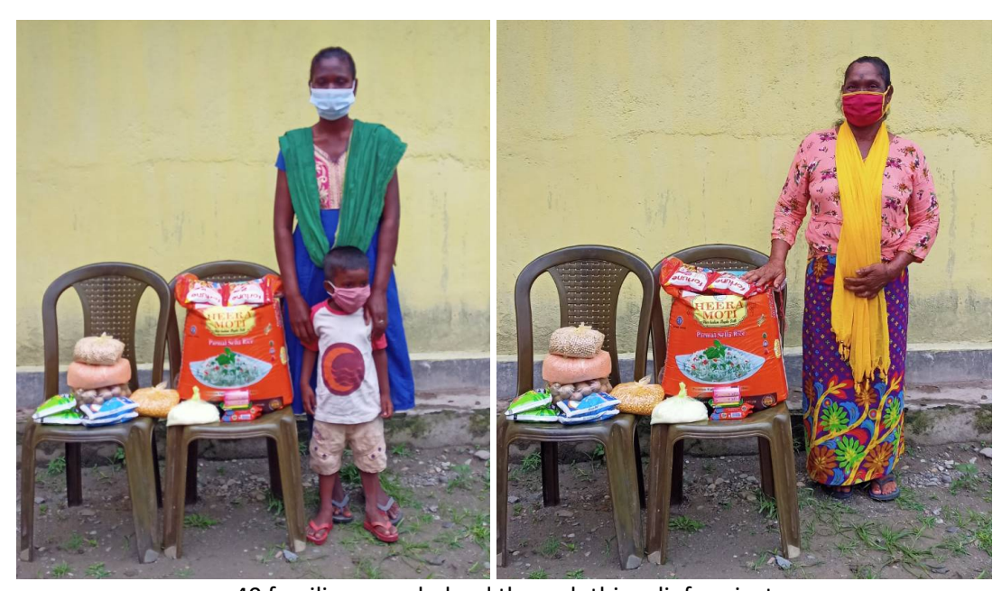
40 families were helped through this relief project