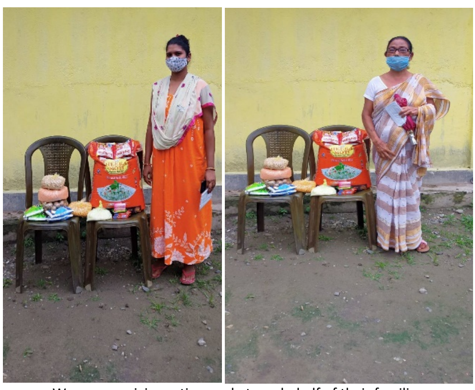
Women receiving ration packets on behalf of their families