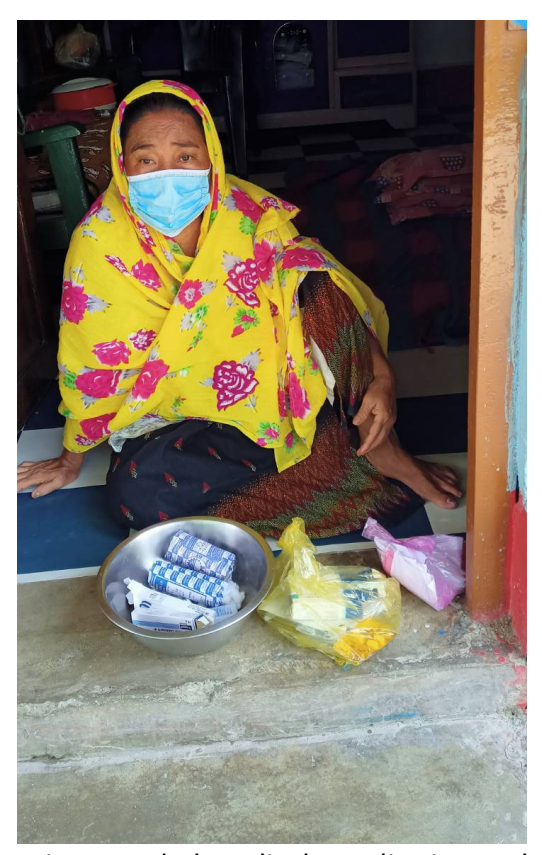
Woman receives needed medical supplies in Northeast BBNJ