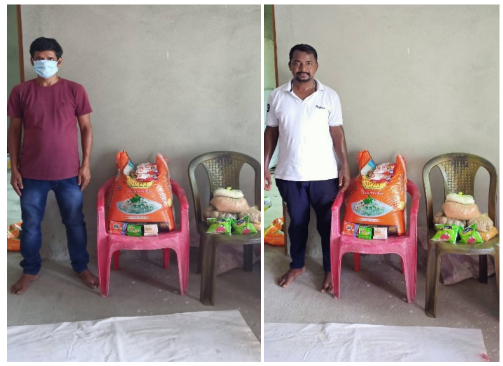
Men receiving ration packets on behalf of their families