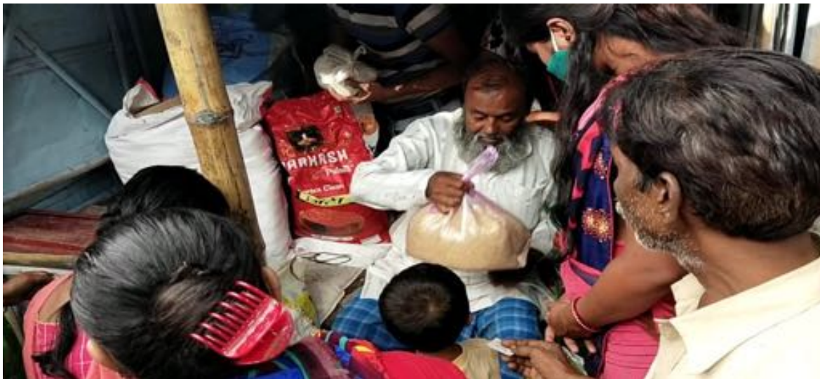
Muslim man receiving ration packet for his family.

Two of BBNJ’s national partners worked together to purchase and distribute relief in 2 Muslim villages. 80 Muslim families received relief. On average, there are approx. 4 people per family. This means that approx. 320 Muslims were given relief in 2 different villages. Praise God for that many people receiving relief. Here are lists of names that represent the “head of household” for each family. Please pray for these BBNJ Muslims to remember the relief that was given and the Gospel that was shared.