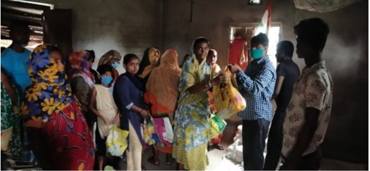
Muslim women coming to a distribution center to receive their ration packets for their families.